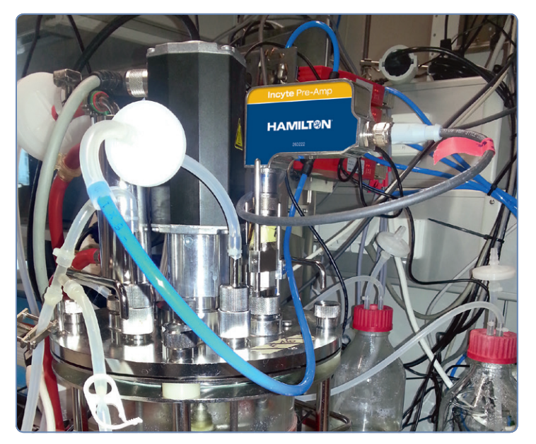
Figure 1: Point of Measurement

The analytic accuracy of sensors can potentially be compromised through the process, especially due to probe drift and variable settings for gas transfer and agitator speed, which are typical manipulated variables for control of dissolved oxygen. However, it was possible to show that the applied probes for pH and dissolved oxygen control were very accurate during cultivation (see table 2). The accuracy of the sensors was almost constant and both parameters set points could be controlled very well over the whole process time. The drift of the online pH probe was evaluated by measuring the pH using an offline sensor in addition. The measured offline values were in very good accordance with the online measured values. Additionally, the drift of dissolved oxygen sensors was characterized through performing two-point calibrations for three batch fermentations within 49 days. The low point (0%) of the two-point calibration had a coefficient of variation of 2.8% and the high point (100%) had a coefficient of variation of 1.9%.